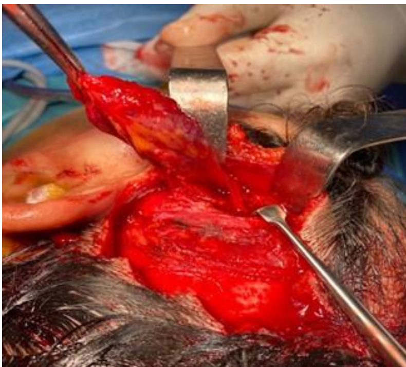
Figure 3: intraoperative view of the hemangioma approached through hemi coronal flap