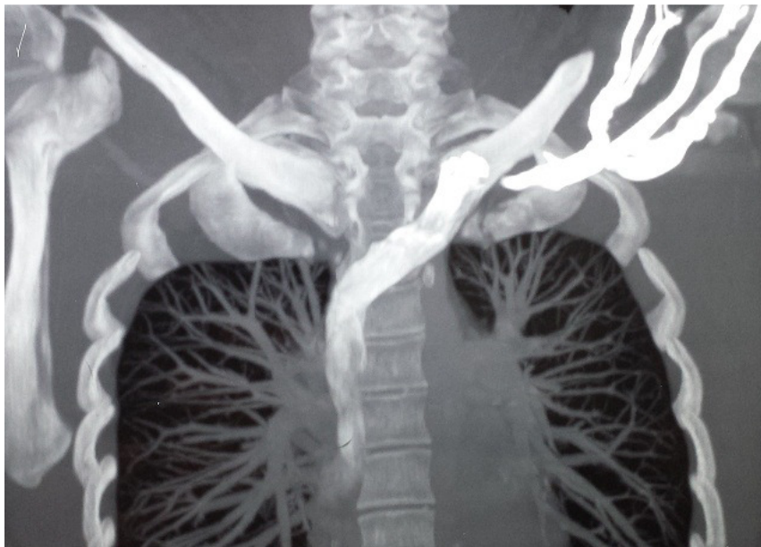
Figure 2: Thoracic CT angiography